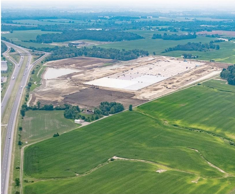
In May, Philadelphia-based discount retailer Five Below broke ground on its planned $100 million Midwest distribution and e-commerce center, the county's first distribution center.

"Utilities, the city and county governments, economic development leaders — we all have the same mission. When companies come, they don't have to talk to the city, then go to the county and have a different conversation, then decide if those visions are different. We work together. We make decisions together. It helps things go smoother and faster. And in the long run, everyone benefits."